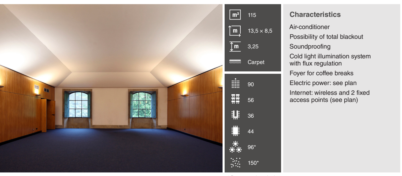
* Pre-approval required